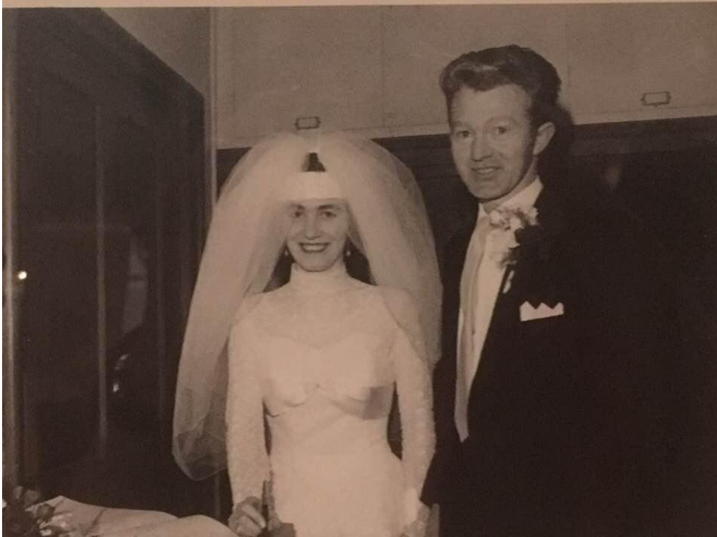
Leixlip, February 8 th 2019. Golden Wedding Anniversary