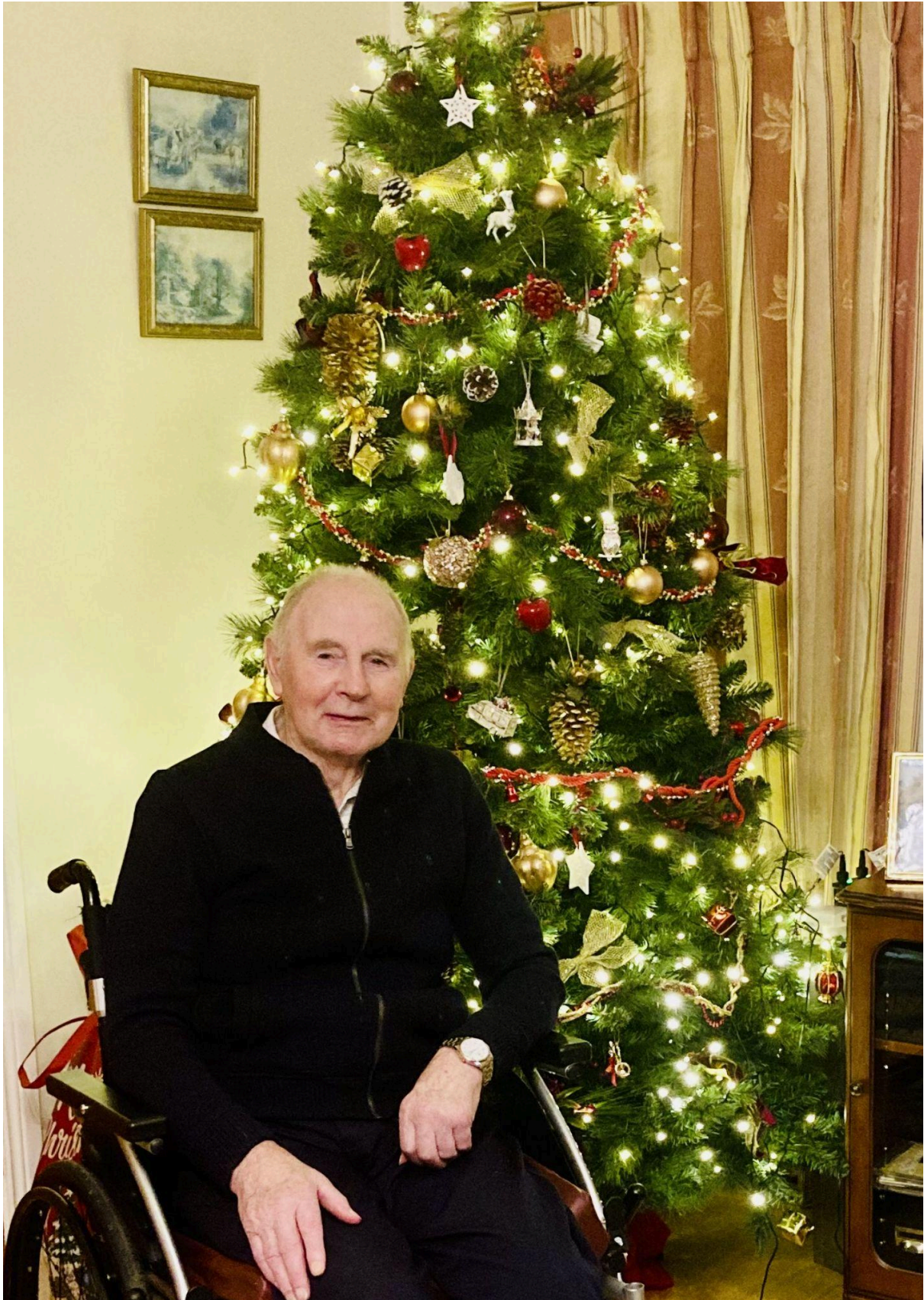
Dad, New Years Day, 1st January 2024